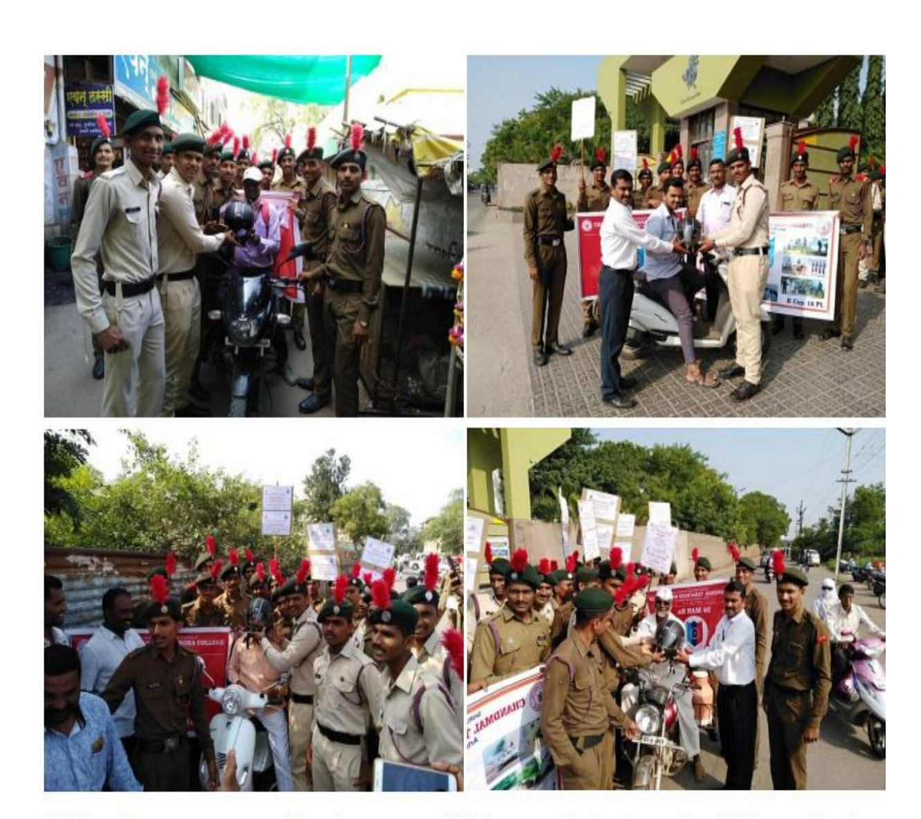
NCC students were aware of the importance of Helmate to the local people of Shirur at Road Safety Week on 28th Sept 2018.