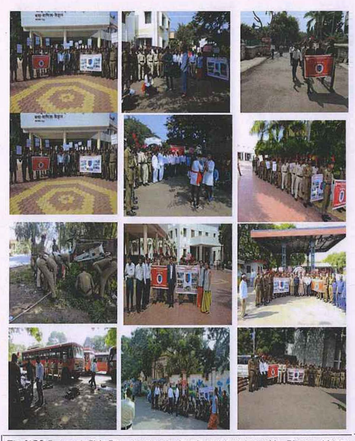
The NCC Boys and Girls Bn were organized and participated swachha Bharat Abhiyan rally at Shirur.