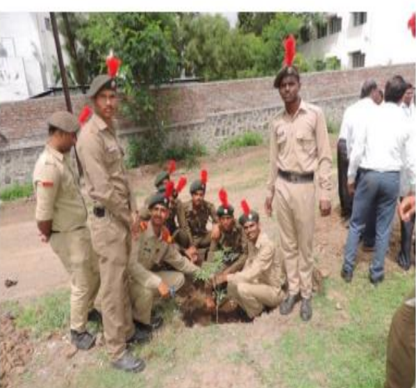
NCC Students were planted different types of plants species at Siddhi Hill, Shirur Nagar Parishad areas at 21<sup>st</sup> June, 2018.