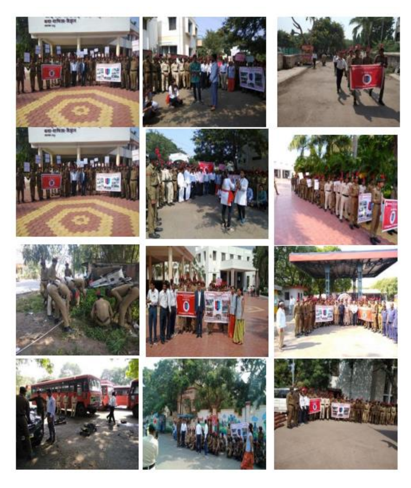
Photographs on Swachha Bharat Abhiyan Rally at Shirur Nagar Parishad Areas